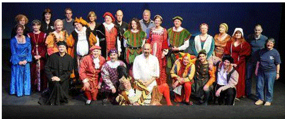
Twelfth Night Cast and Crew